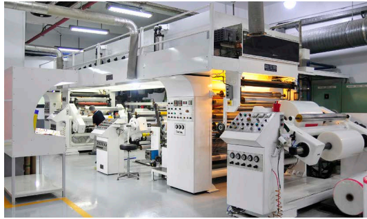
Converting Facility / Incheon, South Korea Converting Perspective