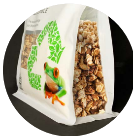
Clear side gussets