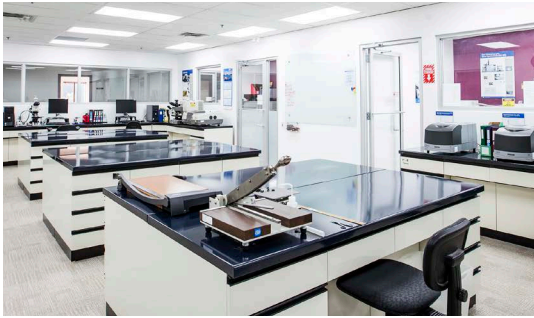
Analytical Lab / Calgary, Canada Scientific Perspective

From pioneering new structures to texturizing brands designs, our integrated Innovation Center combines each core area of expertise needed to tailor your packaging precisely to your specifications.