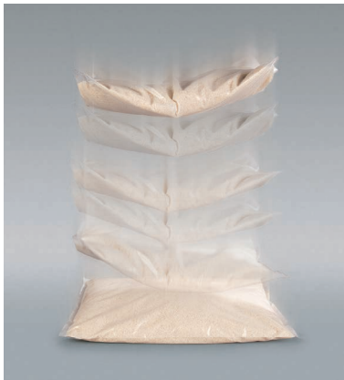
Drop-tested up to 4.5ft