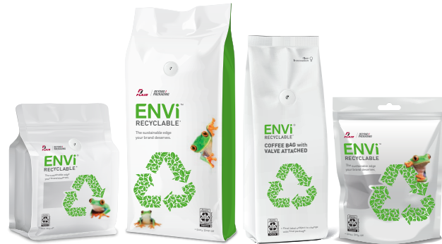
Available in M-seal, stand-up, flat bottom pouches & fractional packs.

Balancing sustainability with protection & appeal for the complete coffee package